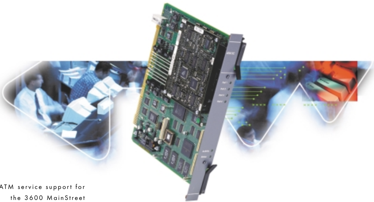
ATM service support for the 3600 MainStreet Bandwidth Manager