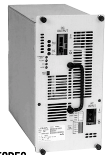
Model A50B50 50 amp Rectifier Module